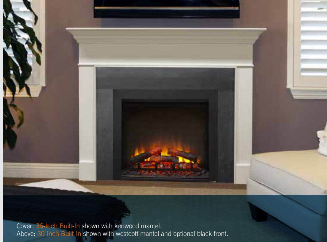
Cover: 36-Inch Built-In shown with kenwood mantel. Above: 30-Inch Built-In shown with westcott mantel and optional black front.